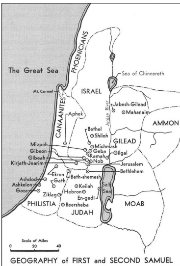
See Ramah - Naioth is in the vicinity