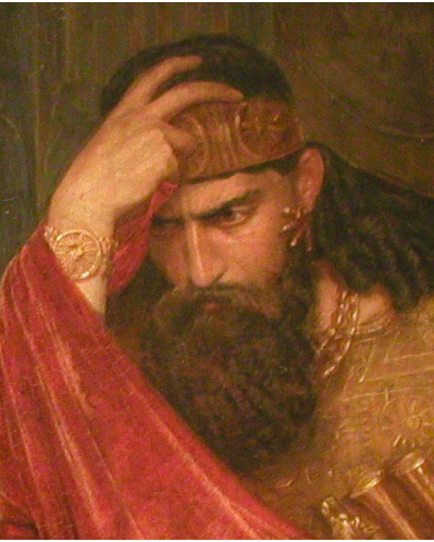
Sinister Spirit Seizes Saul